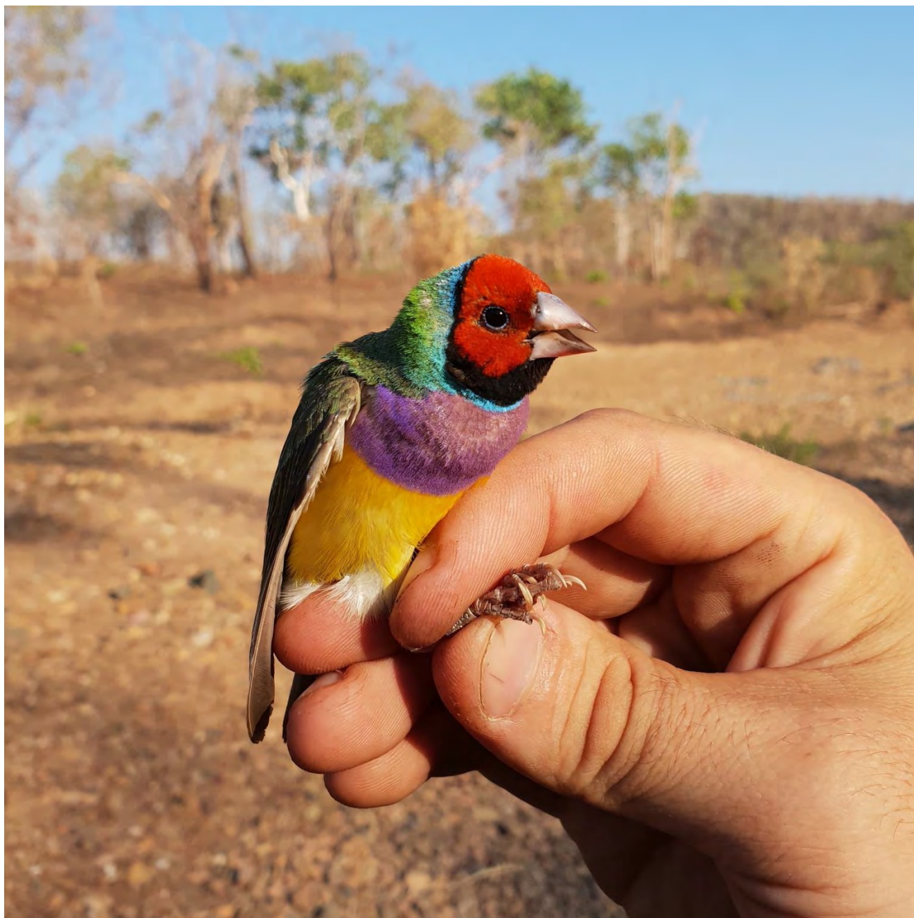
Figure 2 Red faced male Gouldian Finch, Edith Falls Road NT